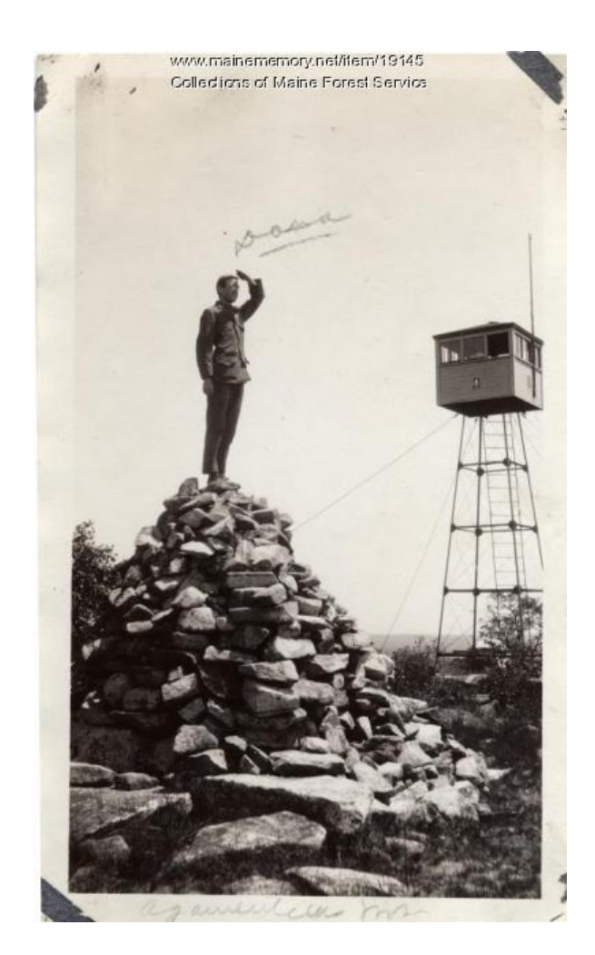
Figure 3 – photo of ranger standing on USGS cairn