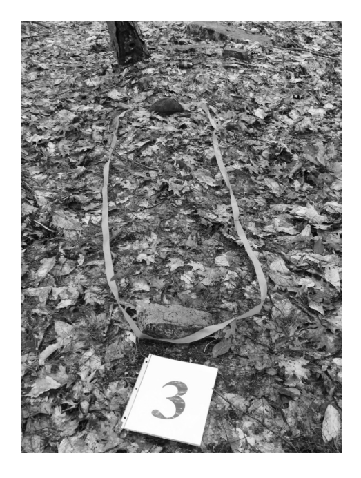
Figure 2 – Close-up one of the four pseudo (memorial) "graves"

Figure 1 – Four pseudo (memorial) "graves" numbered and outlined with surveyors tape in the field.