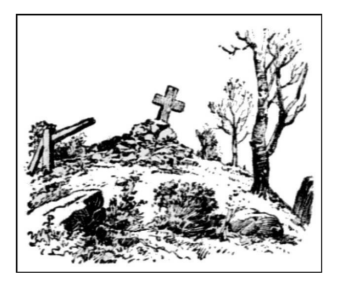
Figure 5 – Romanticized drawing of St. Aspinquid's grave that was widely circulated in a 1899 newspaper supplement.