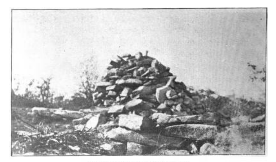
SAINT ASPENQUID'S CAIRN on the Summit of Mt. Agamenticus in York, Maine Photo by Agnes K. Sweeney, Sanford, Me., 1922

Figure 4 – 1922 photo of the summit cairn which appeared in Spragues Journal v.11 no.2 (1923)