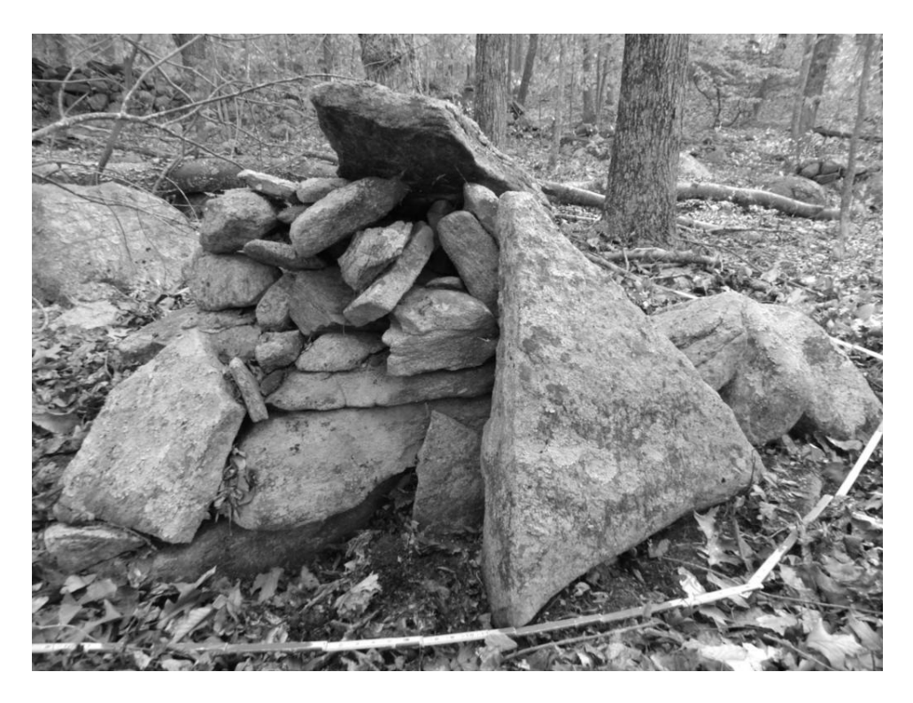
Figure 7 – Mound on ground cairn with three symbolic triangles slabs (Hopkinton, RI)