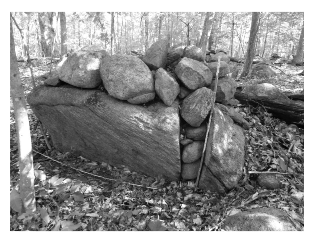
Figure 8 – Split stone cairn with stone offerings placed in split (Hopkinton, RI)

Figure 7 – Mound on ground cairn with three symbolic triangles slabs (Hopkinton, RI)