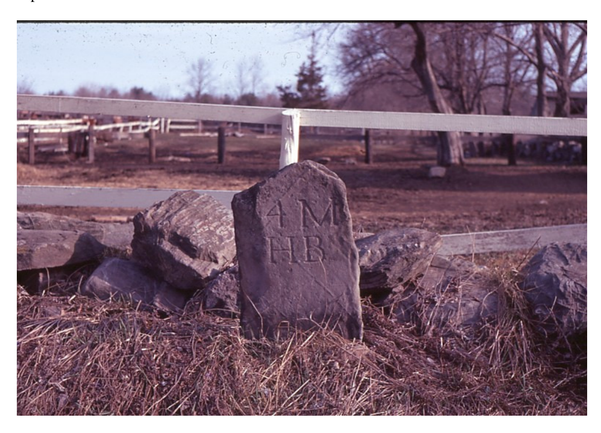
Scan of 1971 slide by Dave Fletcher of Milestone 4 in its original location prior to being rescued in 1972 by a local citizen from demolition.

The section of Broadway Street on which both milestones were found along was built after 1795. The 1795 Haverhill map shows Broadway ending at a parish meeting house about where Interstate 95 crosses the street. No road is shown between the interstate and the New Hampshire border. This section of the street first appears on 1832 Haverhill map. It is labeled the "Salem Road". The milestones therefore post-date 1795.