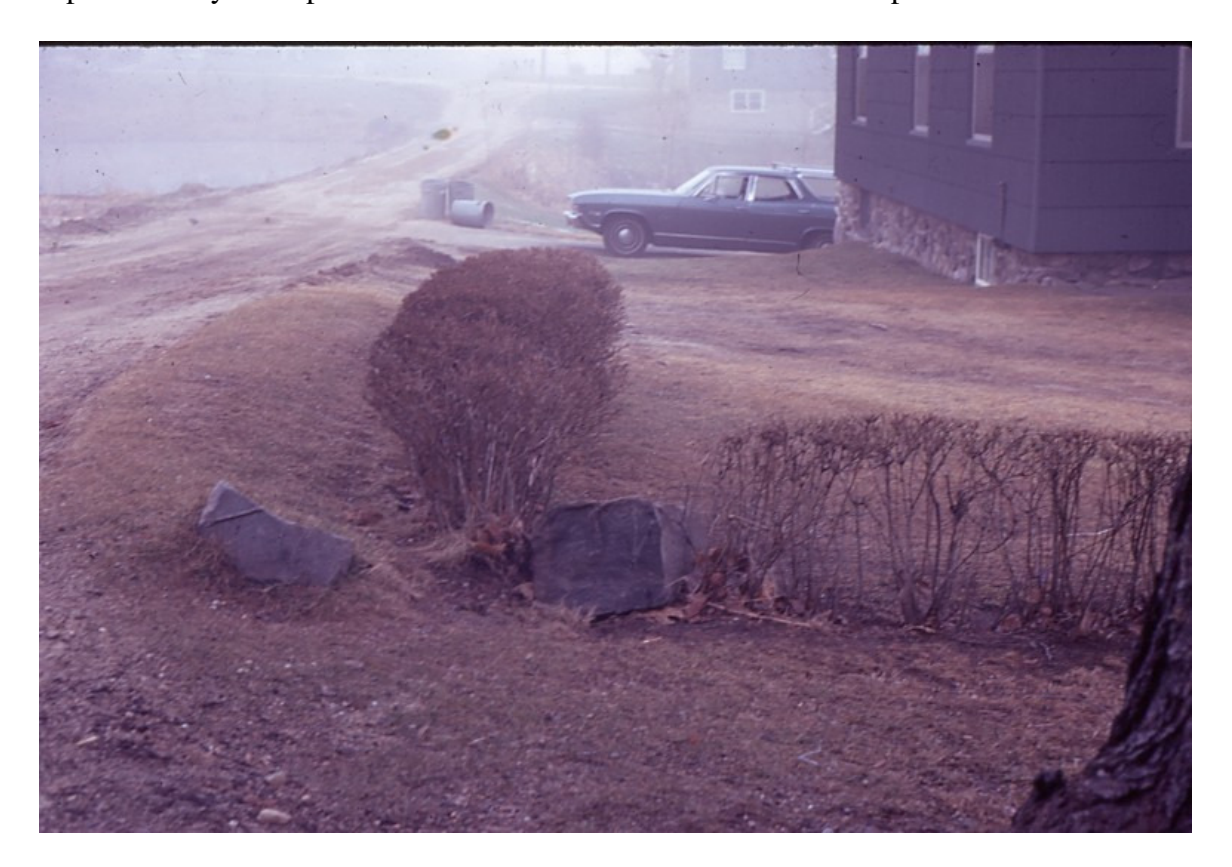
Scan of 1971 slide by Dave Fletcher of Milestone 3

This milestone was in damaged condition as 1971. It is currently in poor condition having broken into at least two pieces. Only the top line of the letter "B" can be seen one of the pieces.