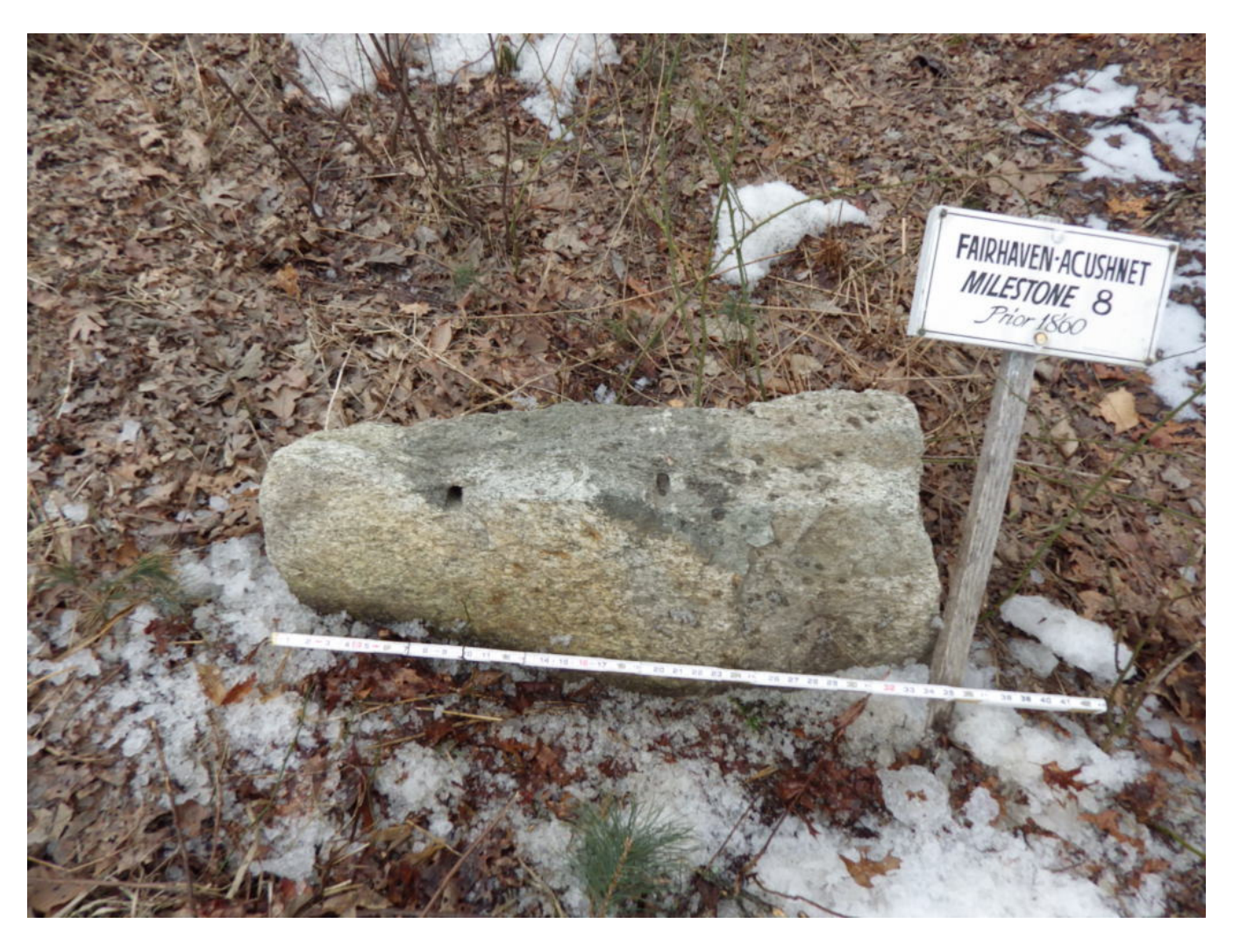
Note: The two drill holes suggest the top of this milestone was split off for unknown reasons