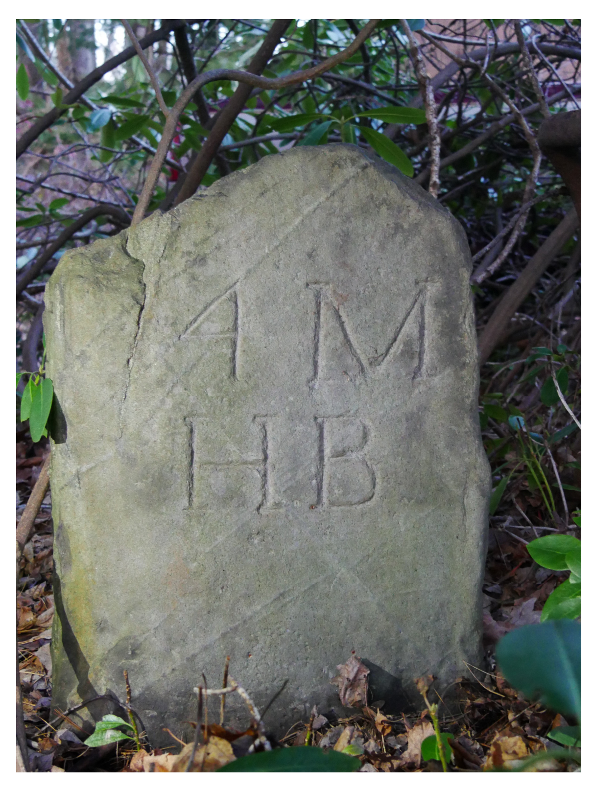
2019 photography by James Gage