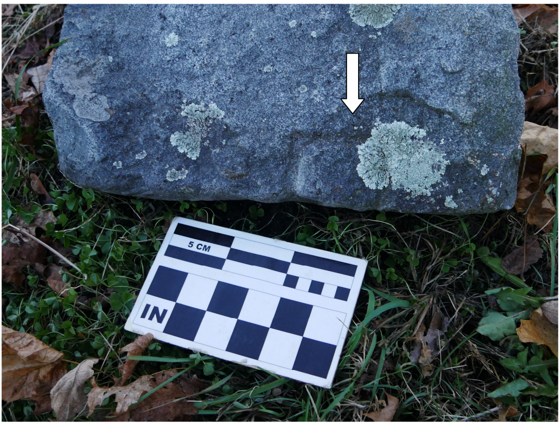
2019 photographs by James Gage (arrow points top of the letter "B")