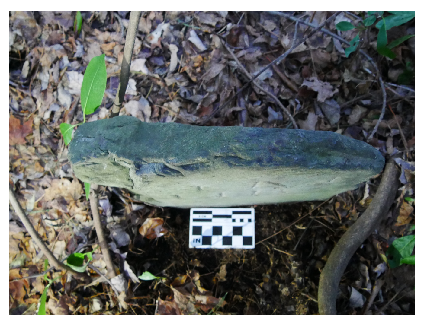
2019 (top down view)